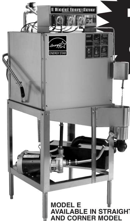
MODEL E AVAILABLE IN STRAIGHT AND CORNER MODEL

USES ONLY 1.01 Gallons Of Water Per Cycle!