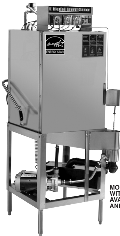
MODEL E EXT WITH 20-1/2" DOOR OPENING AVAILABLE IN STRAIGHT AND CORNER MODEL