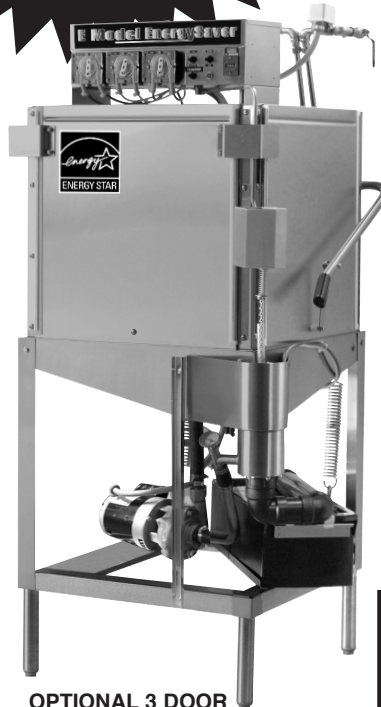
OPTIONAL 3 DOOR MODEL AVAILABLE FOR STRAIGHT AND CORNER OPERATION