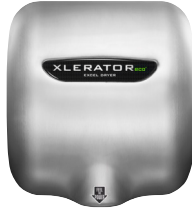
XL-SB-ECO Brushed Stainless Steel