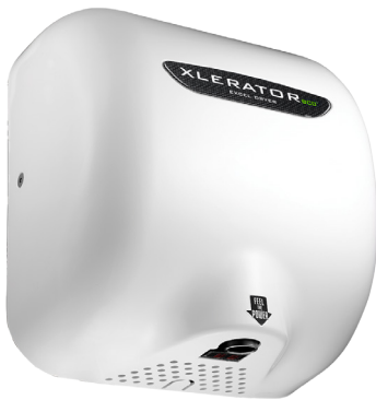
XL-BW-ECO White Thermoset Resin (BMC)