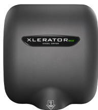
XL-GR-ECO Graphite Textured Painted