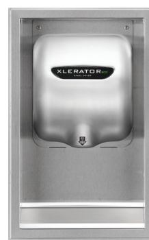
Part # 40502