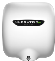
XL-W-ECO White Epoxy Painted