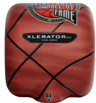
XL-SI-ECO*** Custom Special Image