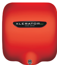
XL-SP-ECO** Custom Special Paint