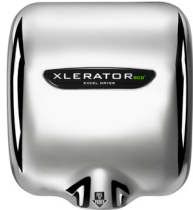
XL-C-ECO Chrome Plated