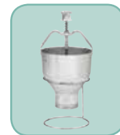
APCD-6 & APCD-6R