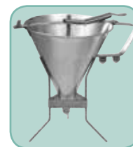
SF-7 &amp; SF-7R