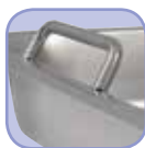
Patented Handle System