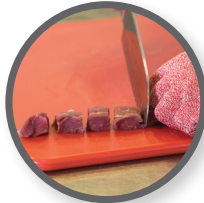
INTEGRATED RULER EASY PORTIONING