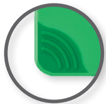
ANTI-SLIP GRIPS HOLD BOARD IN PLACE