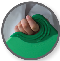
PATENTED FOOD SAFETY HOOK* SANITARY TRANSPORT & STORAGE