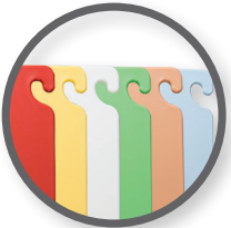
COLOR-CODED TO PREVENT CROSS-CONTAMINATION