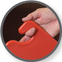
PATENTED FOOD SAFETY HOOK* SANITARY TRANSPORT & STORAGE