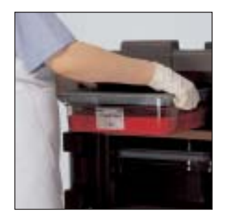
Load food pan with GripLid covers into Camcarts®. Food and liquids won't spill during transport.