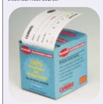
StoreSafe® Food Rotation Label

100% dissolvable and 100% biodegradable labels help to manage a first in, first out (FIFO) approach of inventory usage.