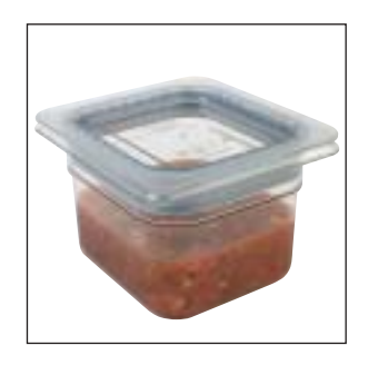
Prep and store make table ingredients and food bar items in Camwear Food Pans covered with GripLids to enhance freshness.

Store, transport, display and serve food with Camwear food pans. Nonstick surface increases yield and is easy to clean.