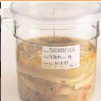
Cover, Label & Date