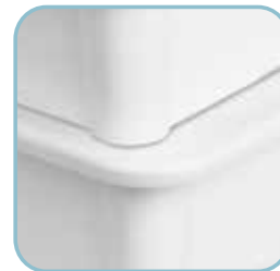
Seamless fit for extra fresh storage needs