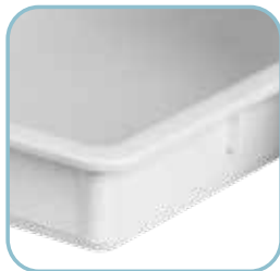
Reinforced edges &amp; corners