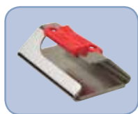
Nested together for additional weight