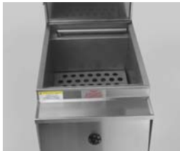
Special stainless steel alloy vessel withstands strong salt concentrations.