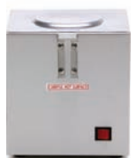
GEM-5 — Heated Satellite Stand (Tall)