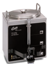
GEM-3— Insulated Satellite Server