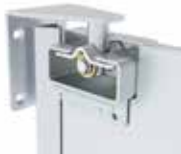
DR-AD-H Aluminum Door Hinge