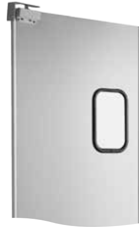
DR-SD-H Stainless Steel Door Hinge